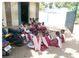
Classrooms under the trees

Maganyam Village Panchayat School - New Classrooms Constructed & Inaugurated by HH MAHARANYAM SRI SRI MURALIDHARA SWAMIJI on 31st July 2019.