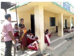
Classrooms in the pathway