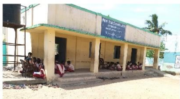
Classrooms in the pathway

Condition before construction of classrooms at Maganyam Village Panchayat School